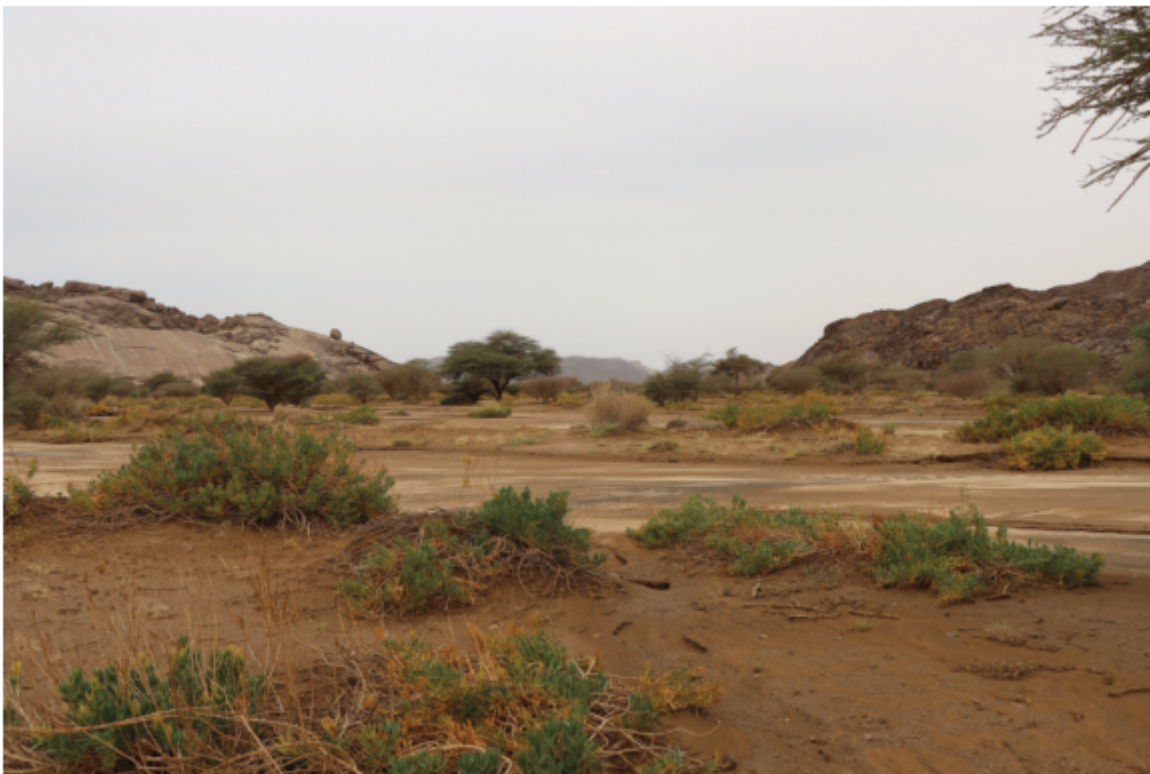
Figure 8. Habitat at the type locality of Leiurus hadb sp. nov., from Wadi Rawdat al-hadb, Riyadh region Saudi Arabia.