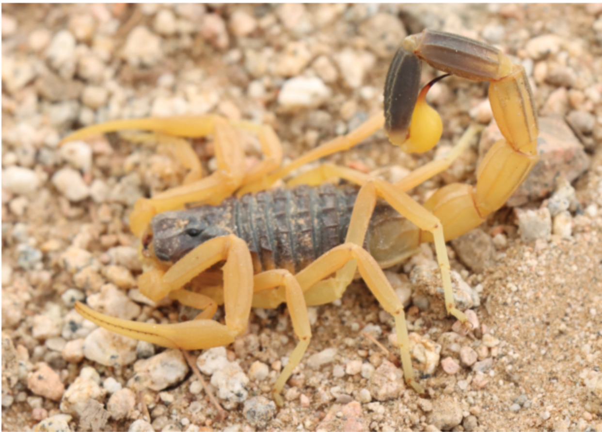
Figure 7. Leiurus hadb sp. nov., from Wadi Rawdat al-hadb, Riyadh region Saudi Arabia.

Leiurus hadb (Al-Qahtni, Al-Salem, Alqahtani & Badry, 2023)