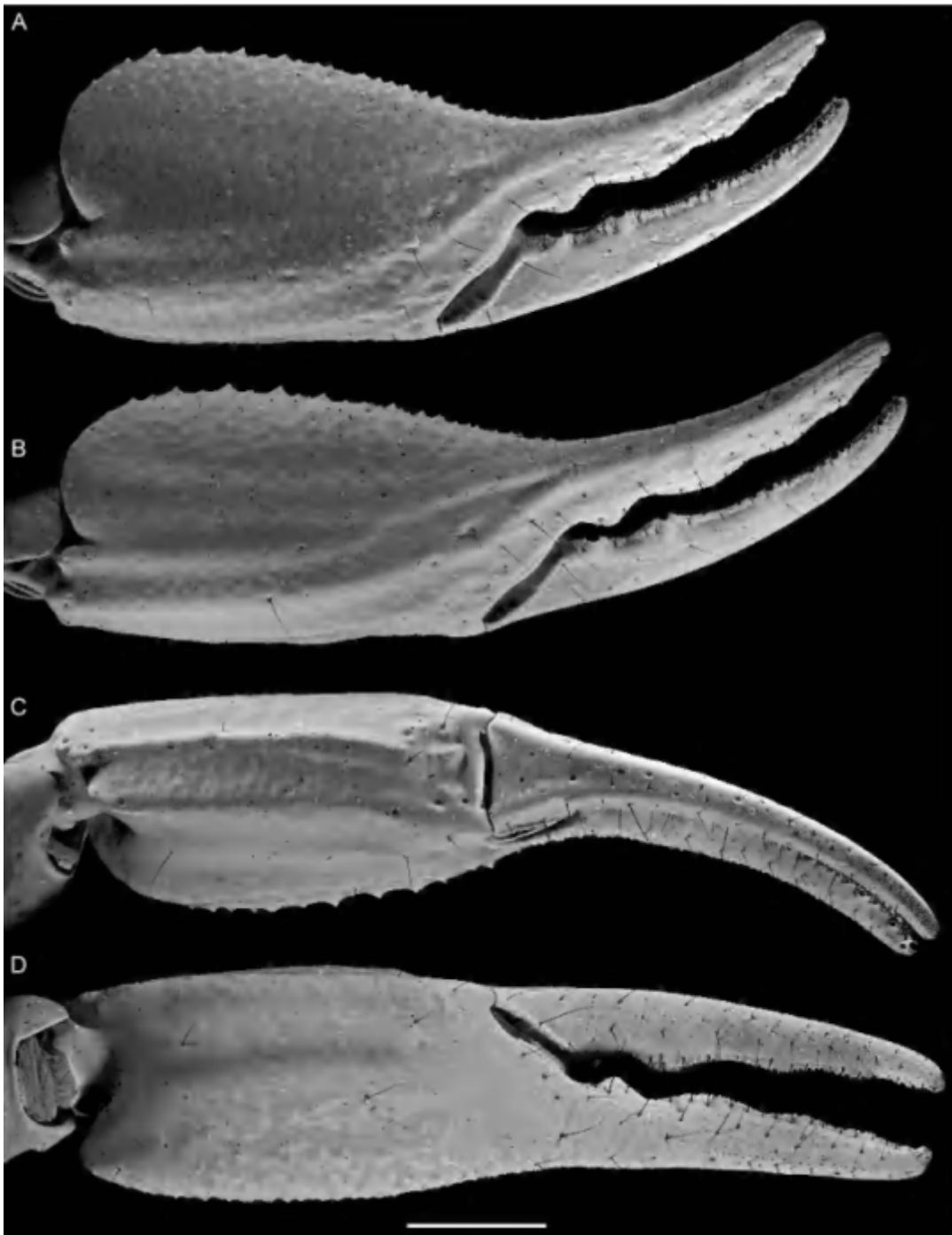
FIGURE 177. Heterometrus longimanus (Herbst, 1800), pedipalp chela: A, B. retrodorsal, C. ventral, and D. prolateral aspects. A. ♂ (AMNH), B-D. ♀ (AMNH), Kuching, Malaysia. Scale bar = 5 mm.