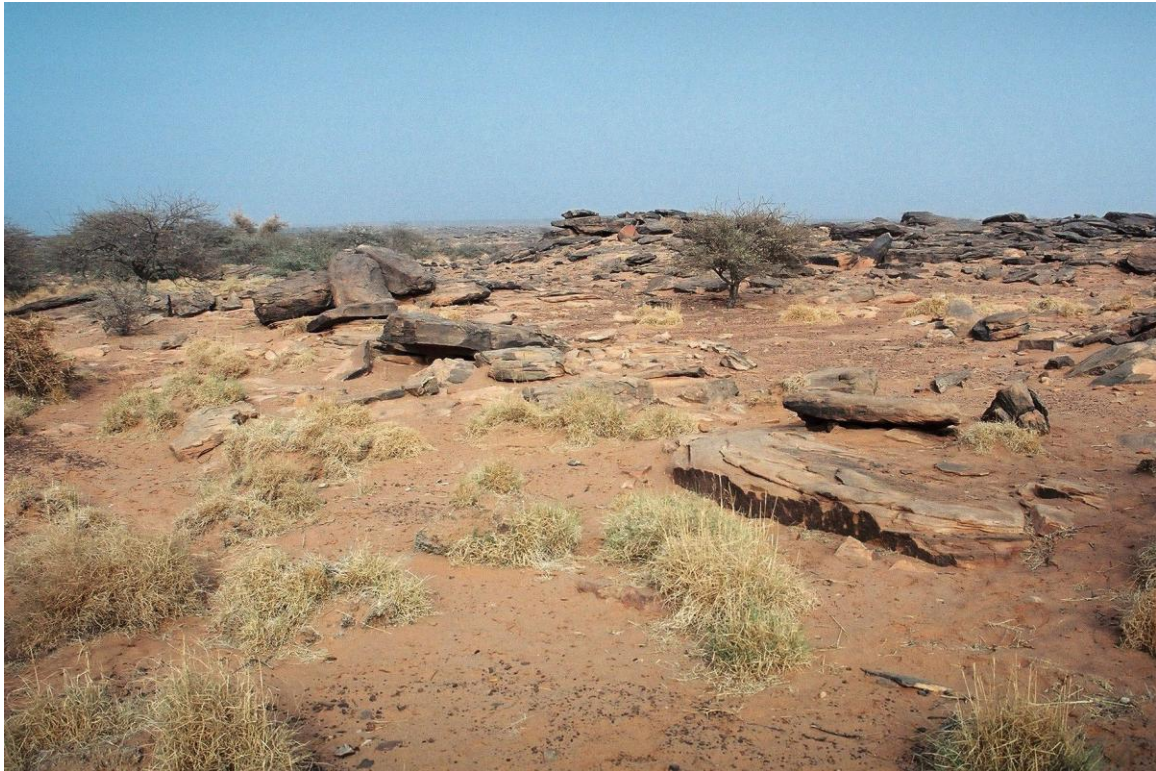
Fig. 12. Typical desert formation in Central Mauritania, near to the type locality of Microbuthus saharicus sp. n.

According to Vachon (1951b), Microbuthus species could be classified as halophiles, since up to that date these were exclusively found in coastal zones, stretching from the Red Sea to the Atlantic Ocean. This ecological particularity was further confirmed for other species such as M. maroccanus (see Lourenço, 2002 for details). Lowe (2010) however, rejected this ecological trait and argues that for the species found in the Middle East this characteristic was unreliable. The new species described here, seems to confirm in part this assumption (Fig. 12). It was collected far from coastal zones and on an arid environment. Further discoveries should bring a more precise ecological pattern.