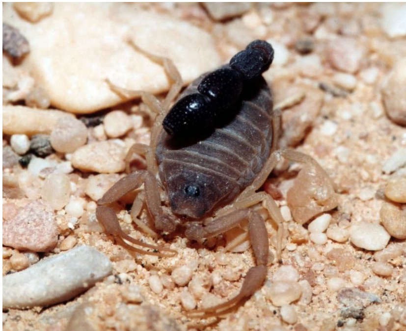
Fig. 1. Female holotype of Microbuthus flavorufus alive in the natural habitat in Egypt.

Among the wide array of known genera of Buthidae scorpions, Microbuthus remains enigmatic. The reasons for this are associated not only with the several unique morphological features of the different species, but are also due to the scarcity of available material for study. At present, a new species is described from the inland deserts of Mauritania, escaping therefore to the previous observed pattern of distribution along coastal zones. This discovery marks the fifth species documented in Africa. The disrupted peri-Saharan pattern of distribution observed among the species of the genus appears to be reaffirmed once more.