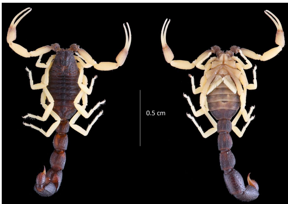
Figs. 2-3. Microbuthus saharicus sp. n. Male holotype. Habitus, dorsal and ventral aspects.

Colouration (Figs. 2-3). Body dark brown with appendages yellow to pale yellow; only coxa and trochanter of pedipalps are dark. Prosoma: carapace dark brown; eyes intensely marked with a black pigmentation. Mesosomal tergites dark brown; tergite VII slightly paler with some yellowish zones. Metasomal segments I to V brown to dark brown with some yellowish zones; segments IV and V darker than I to III. Vesicle reddish-yellow; aculeus yellowish at the base and reddish at the tip. Venter, coxapophysis, sternum, genital operculum and pectines yellowish; pectines paler than the other structures; sternites yellowish with marked brownish zones; sternite VII darker than the others. Chelicerae yellow with some dark reticulated spots at the base of fingers; fingers yellowish with reddish teeth. Pedipalps pale yellow with coxa and trochanter dark brown, including proximal zone of femur; granulations on cutting edge of fingers slightly reddish. Legs pale yellow without any spots.